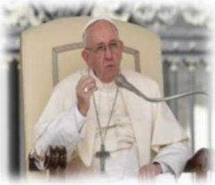
Pope Francis Apostolic Journey

My Apostolic Journey to Mozambique, Madagascar and Mauritius.